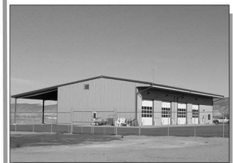
The new Olathe Public Works shop.

YOU ARE INVITED New Town Shop Open House in March Date & Time To Be Announced